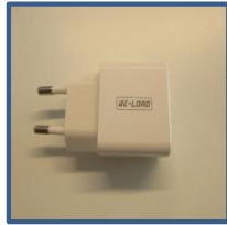
Image de l'article. Sample picture of the item.

L'objet décrit est conforme à la législation d'harmonisation de l'Union pertinente: The described object of the declaration is in conformity with the relevant Union harmonisation legislation: