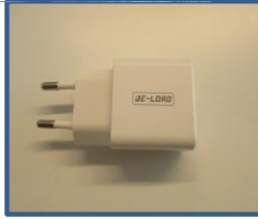
Foto del artículo Picture of the item

El objeto descrito se ajusta a la legislación pertinente de armonización de la Unión: