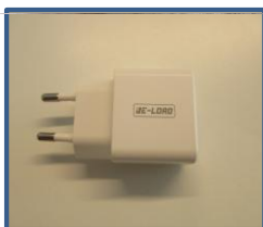
Foto článku Picture of the item

Tento popis je v souladu s příslušnými harmonizačními právními předpisy Unie: The described object of the declaration is in conformity with the relevant Union harmonisation legislation: