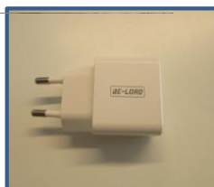
Foto a articolului Picture of the item

Obiectul descris este în conformitate cu legislația relevantă de armonizare a Uniunii: The described object of the declaration is in conformity with the relevant Union harmonisation legislation: