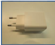
Foto del prodotto Picture of the item

L'oggetto descritto è conforme alla pertinente normativa di armonizzazione dell'Unione: