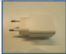
Foto del artículo Picture of the item

El objeto descrito se ajusta a la legislación pertinente de armonización de la Unión: