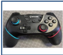
Foto a articolului Picture of the item

Obiectul descris este în conformitate cu legislația relevantă de armonizare a Uniunii: