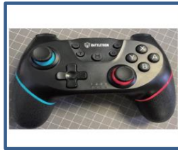
Foto rakstu Picture of the item

Aprakstītais mērķis ir saskaņā ar attiecīgajiem Savienības saskaņošanas tiesību aktiem: The described object of the declaration is in conformity with the relevant Union harmonisation legislation: