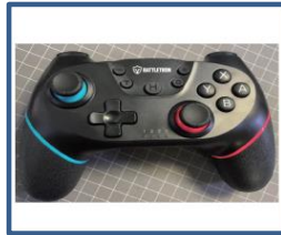
Foto del artículo Picture of the item

El objeto descrito se ajusta a la legislación pertinente de armonización de la Unión: The described object of the declaration is in conformity with the relevant Union harmonisation legislation: