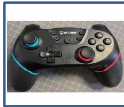
Bild av artikeln Picture of the item

Det beskrivna objektet överensstämmer med relevant EU-harmoniseringslagstiftning: The described object of the declaration is in conformity with the relevant Union harmonisation legislation: