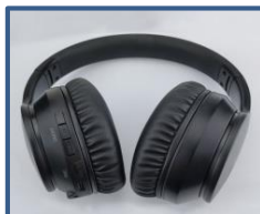
Foto del prodotto Picture of the item

L'oggetto descritto è conforme alla pertinente normativa di armonizzazione dell'Unione: