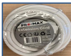
Foto del prodotto Picture of the item

L'oggetto descritto è conforme alla pertinente normativa di armonizzazione dell'Unione: