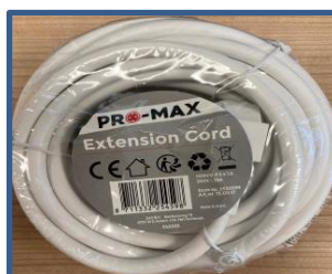
Foto a articolului Picture of the item

Obiectul descris este în conformitate cu legislația relevantă de armonizare a Uniunii: