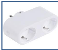
Bild av artikeln Picture of the item

Det beskrivna objektet överensstämmer med relevant EU-harmoniseringslagstiftning: The described object of the declaration is in conformity with the relevant Union harmonisation legislation: