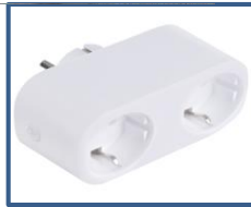
Foto del prodotto Picture of the item

L'oggetto descritto è conforme alla pertinente normativa di armonizzazione dell'Unione: The described object of the declaration is in conformity with the relevant Union harmonisation legislation: