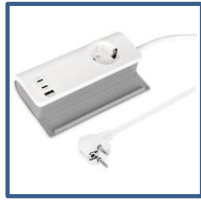
Image de l'article. Sample picture of the item.

L'objet décrit est conforme à la législation d'harmonisation de l'Union pertinente: The described object of the declaration is in conformity with the relevant Union harmonisation legislation: