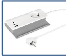
Foto del artículo Picture of the item

El objeto descrito se ajusta a la legislación pertinente de armonización de la Unión: The described object of the declaration is in conformity with the relevant Union harmonisation legislation: