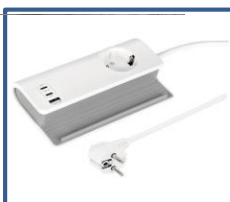
Foto a articolului Picture of the item

Obiectul descris este în conformitate cu legislația relevantă de armonizare a Uniunii: The described object of the declaration is in conformity with the relevant Union harmonisation legislation: