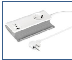
Foto del prodotto Picture of the item

L'oggetto descritto è conforme alla pertinente normativa di armonizzazione dell'Unione: The described object of the declaration is in conformity with the relevant Union harmonisation legislation: