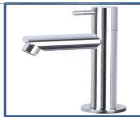
Foto del prodotto Picture of the item

L'oggetto descritto è conforme alla pertinente normativa di armonizzazione dell'Unione: The described object of the declaration is in conformity with the relevant Union harmonisation legislation: