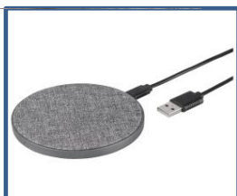
Foto del prodotto Picture of the item

L'oggetto descritto è conforme alla pertinente normativa di armonizzazione dell'Unione: