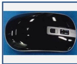
Foto a articolului Picture of the item

Obiectul descris este în conformitate cu legislația relevantă de armonizare a Uniunii: