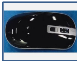
Foto del prodotto Picture of the item

L'oggetto descritto è conforme alla pertinente normativa di armonizzazione dell'Unione: The described object of the declaration is in conformity with the relevant Union harmonisation legislation: