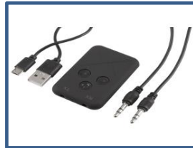
Foto del prodotto Picture of the item

L'oggetto descritto è conforme alla pertinente normativa di armonizzazione dell'Unione: The described object of the declaration is in conformity with the relevant Union harmonisation legislation: