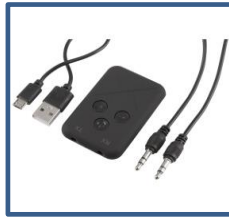
Image de l'article. Sample picture of the item.

L'objet décrit est conforme à la législation d'harmonisation de l'Union pertinente: The described object of the declaration is in conformity with the relevant Union harmonisation legislation: